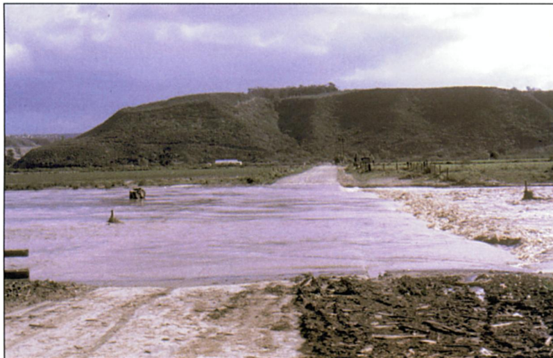
Figure 2. In 1980, the Tijuana River flood washed out 19th Street in Imperial Beach, California; as a result of recurrent flooding this was never repaired.

the marsh plain (the most widely distributed being pickleweed, Sarcocornia pacifica , formerly Salicornia virginica ), and a high marsh with evergreen cover and a diversity of annual plants at the edges of salt pans (Zedler et al. 1992). Details of compositional changes are in Zedler and West (2008). Here, I describe in a conceptual manner how the vegetation responded to increased storminess (more frequent extreme events with greater extremes; Table 1). Recognizing how increased storminess can affect vegetation should help others forecast impacts of prolonged climate-change-related effects across a broader range of ecosystems.