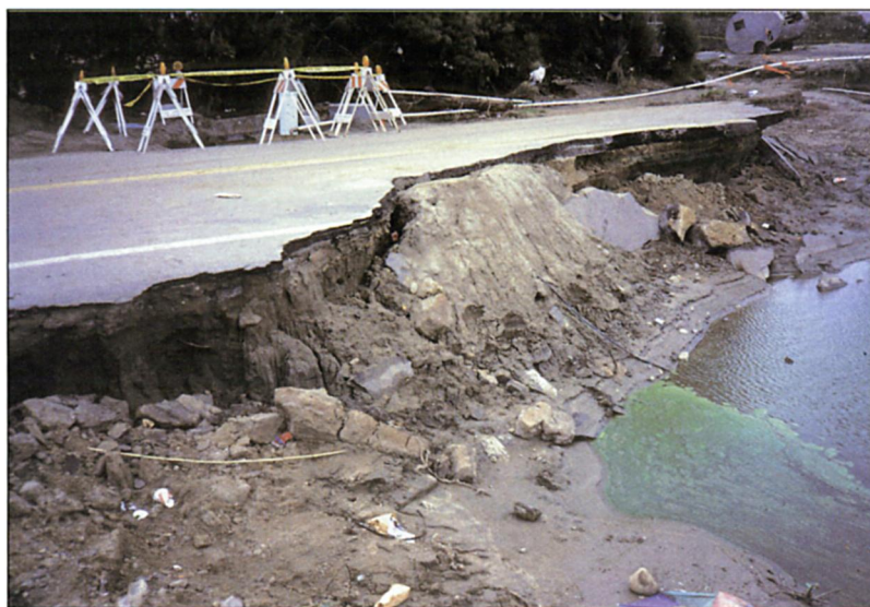
Figure 3. The Tijuana River flood in 1993 cut a new channel through the Tijuana River Valley, damaging Hollister Road, destroying an adjacent house, and moving sediment into the nearby estuary.

Six different types of responses of the salt marsh were identified: direct, indirect, interactive, additive, unsea-