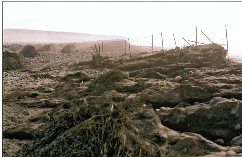
Figure 4. Waves and wind eroded the sand dune adjacent to Tijuana Estuary during the 1983 ENSO. Small patches of sand were stabilized by a native deep-rooted perennial that was part of a dune stabilization experiment.

Sequential effects differ with the order of events (Maio et al. 2009). At Tijuana Estuary, the largest effect on salt-marsh diversity occurred in 1984, when river-mouth clo-