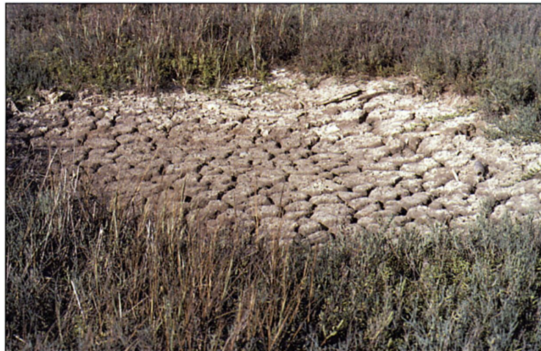
Figure 6. Drought during the 8-month, non-tidal period (Figure 5a) converted tidal pools and creeks into dry, salt crusts. Cordgrass died and pickleweed thrived.

Faced with a sequence of catastrophic events, native species are not likely to persist in familiar assemblages, but will instead form no-analog communities (Williams and Jackson 2007). The regional management goal could be to retain all native species somewhere in the landscape (“preserve all the parts”; Leopold 1938), rather than to sustain current plant communities or restore historical communities. Planners could then make a strong case for testing “futuristic plantings” with novel assemblages, varying species richness and genotypes, and allowing extreme events to select for tolerant combinations, thereby building resilience into subsequent restoration projects. The following actions would help restoration ecologists plan such projects.