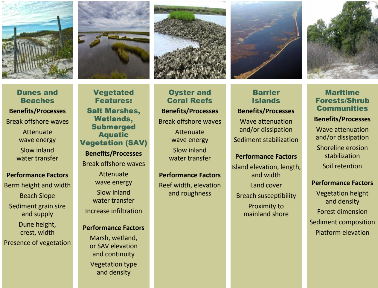
Figure 1: Natural and nature-based features at a glance. For more detailed information, see summary table in Appendix A.

GENERAL COASTAL RISK REDUCTION PERFORMANCE FACTORS: STORM INTENSITY, TRACK, AND FORWARD SPEED, AND SURROUNDING LOCAL BATHYMETRY AND TOPOGRAPHY