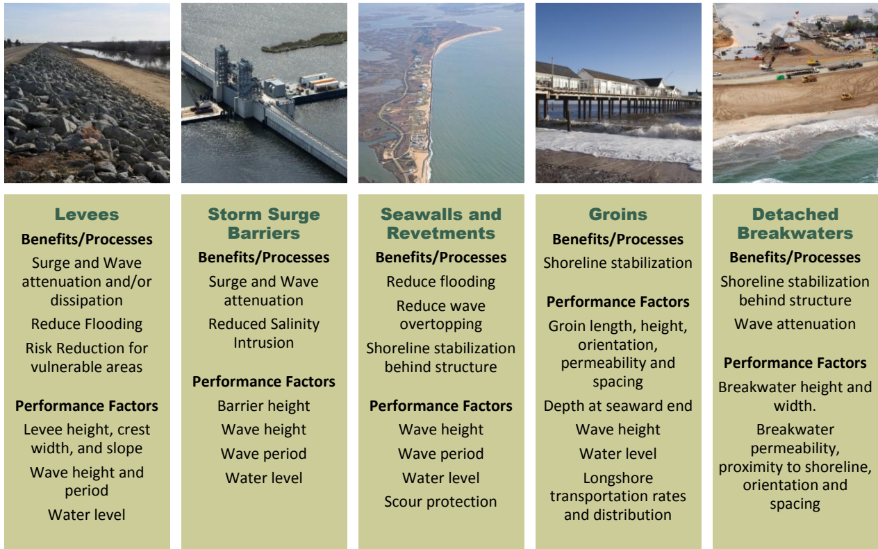
Figure 3. Structural features at a glance. For more detailed information, see summary table in Appendix A.

GENERAL COASTAL RISK REDUCTION PERFORMANCE FACTORS: STORM SURGE AND WAVE HEIGHT/PERIOD, WATER LEVEL