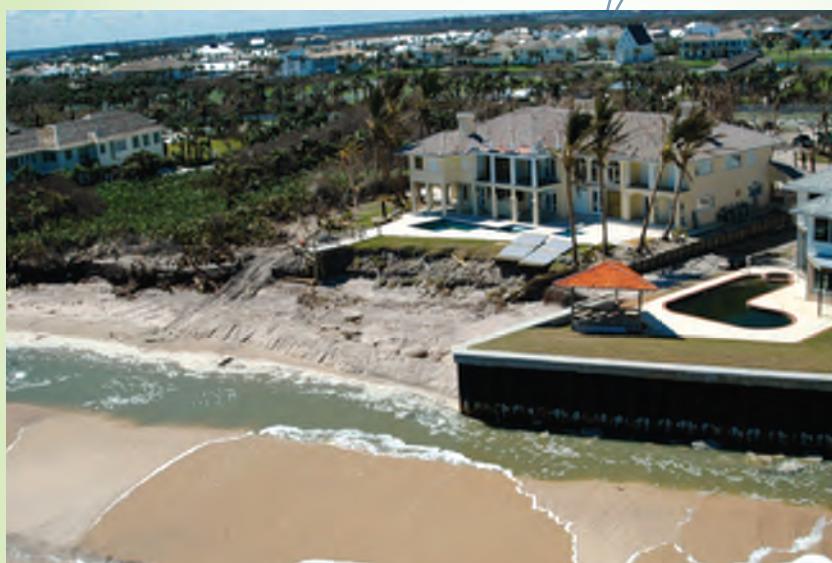
FIGURE 1: Sea Walls (Dothan, Alabama)

The sea wall on the right reflects wave energy and exacerbates erosion on the adjacent properties.