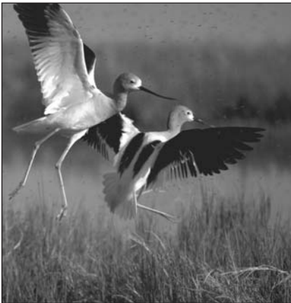
U.S. Fish and Wildlife Service

This document describes eighteen possible “adaptation strategies” that have been proposed