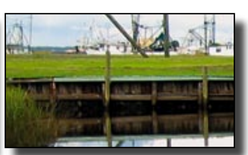
Mississippi-Alabama Sea Grant Consortium A bulkhead alters a shoreline.