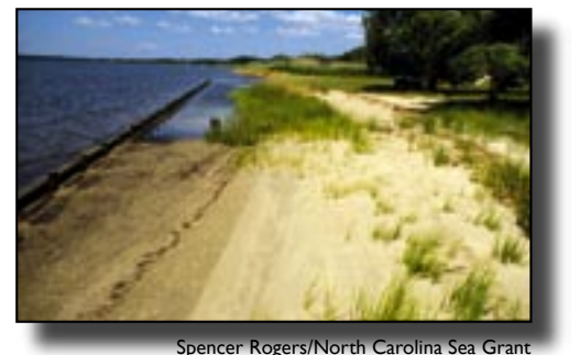
This wooden sill is designed to protect existing or newly planted wetland vegetation.

Hybrid structures: Marsh fringe with groins, marsh fringe with sills or rocks positioned parallel to shore, marsh fringe with breakwaters and beach nourishment with breakwaters are hybrid structures for shoreline protection. Hybrid structures are used to restore, protect and create shoreline habitat while maintaining natural sedimentation and water exchange.