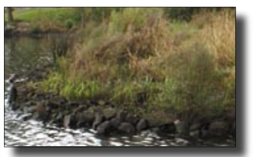
Mississippi-Alabama Sea Grant Consortium Riprap and plantings protect a shoreline.