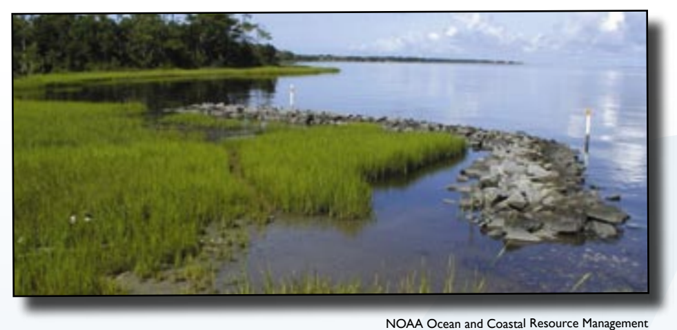
Rock sill with marsh restoration is a living shoreline hybrid structure.

Another problem is that the stabilization structure likely will not provide lifelong success unless people can understand the big picture of the geology and topography of the coast and the many variables that shape the