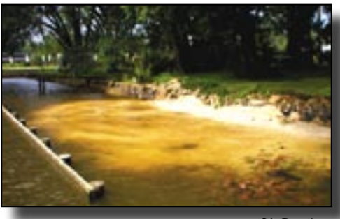
A wooden breakwater with vegetative planting in Dog River, Mobile, Ala.

Groins: Groins are long, narrow walls or mounds of rock built perpendicular to the shoreline. They minimize transport of sand down a beachfront. Groins and jetties may accelerate or induce erosion problems on the adjacent shorelines. Areas downshore may be deprived of sediments, which may lead to scouring and erosion.