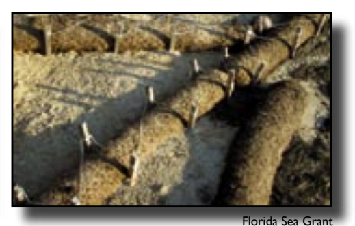
This soft, non-structural stablization method uses natural vegetation, Spartina alterniflora .

allowing coastal processes to occur in an unconfined way.