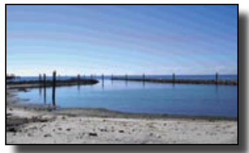
Mississippi-Alabama Sea Grant Consortium Jetties are used to stabilize navigational channels and inlets.