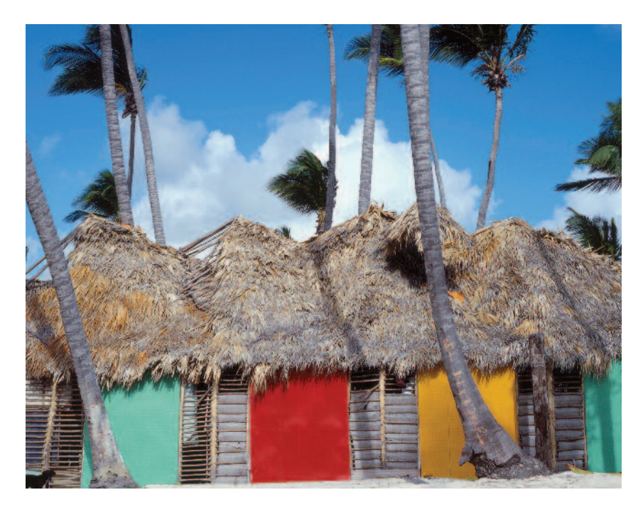
Table ES-2 presents the cost of inaction for each country included in the study. While the regional average is large, rising from five percent of GDP in 2025 to 22 percent in 2100, there is also considerable variation around this average; some countries have much higher projected impacts. The projected cost of inaction reaches an appalling 75 percent of GDP or more by 2100 in Dominica, Grenada, Haiti, St. Kitts & Nevis, and Turks & Caicos, and smaller, but still impressively high levels for a number of others islands.

Sources: Authors' calculations. Amounts in 2007 dollars; percentages based on 2004 GDP.