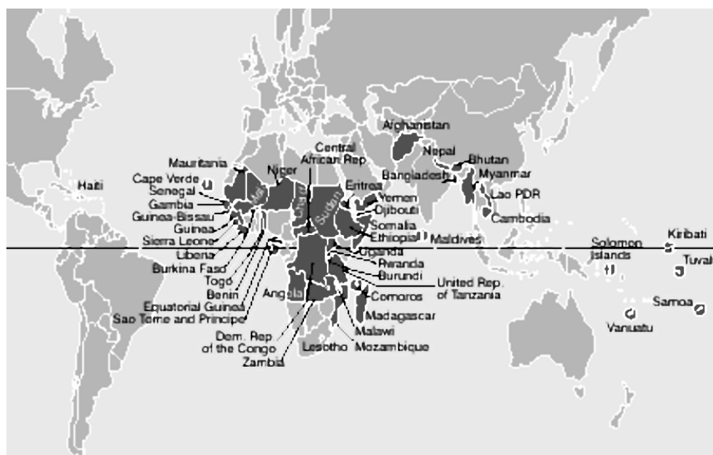
Figure 1: Map of the LDCs (UN, 2001a)

Three criteria, developed by the Economic and Social Council of the United Nations, are used to determine which countries belong to the LDC group. The first one is the low-income criterion, which is based on a three-year average estimate of the GDP per capita. The GDP per capita must be under $900 to be included in the LDC group and above $1,035 to graduate from that group. The second criterion is the human resource weakness criterion, which involves the Augmented Physical Quality of Life Index (APQLI) based on nutrition, health, education and adult literacy indicators. The final criterion is the economic vulnerability criterion, which involves the Economic Vulnerability Index (EVI) based on indicators of: the instability of agricultural production, the instability of exports of goods and services, the economic importance of non-traditional activities (share of manufacturing and modern services in GDP), merchandise export concentration, and the handicap of economic smallness.