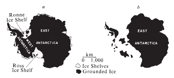
Fig. 3 a, Antarctic ice cover today, and b, after a 5-10 °C warming.

over the Ross and Filchner–Ronne ice shelves up to those now prevailing in the northwestern Antarctic Peninsula. Once this level of comparative warmth had been reached, deglaciation would probably be rapid, perhaps catastrophically so, because even a small additional rise in temperature would affect a large expanse of gently sloping ice shelf. As Hughes<sup>32</sup> graphically describes it, "a relatively minor climatic fluctuation along the ice shelf calving barrier can unleash dynamic processes independent of climate that cause calving bays to remorselessly carve out the living heart of a marine ice sheet." An example of deglaciation by the calving bay mechanism was the extremely rapid disintegration of the central portion of the Laurentide Ice Sheet, centred over the present Hudson Bay, sometime between 8,000 and 7,500 BP, after thousands of years of slow recession on land<sup>38</sup>.