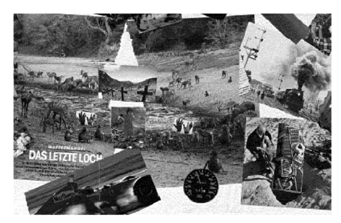
Fig. 1. Detail of a collage associated with a high-energy future (BAU-scenario).