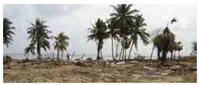
Batticaloa - damage due to tsunami

Both Batticaloa and Negombo lack proper tools and facilities to manage disaster risk situations, and there is limited awareness of climate change related hazards and risks which hinders the cities resilience to climate change.