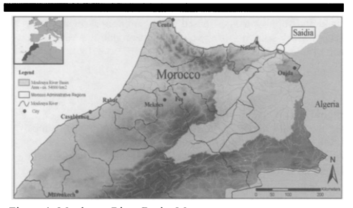
Figure 1: Moulouya River Basin, Morocco

most critical resource in this marginal and semi-arid region and its availability a decisive criterion for regional development in both terms, economically and ecologically. An increasing variability in water availability could exceed the regions adaptive capacity.