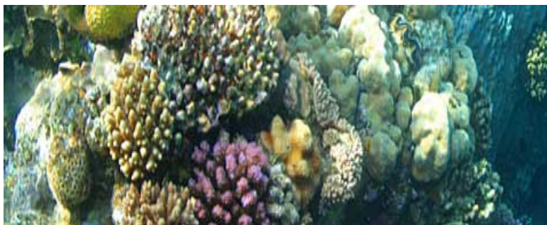
Figure 1. Red sea marine hábitat.