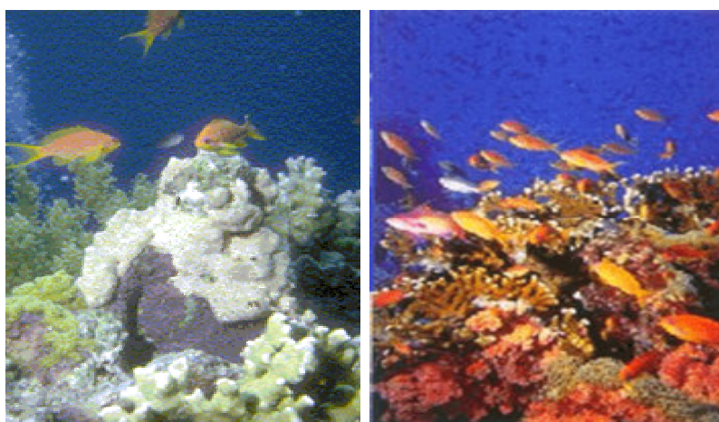
Figure 2. Bleached Coral Reef in Red Sea.