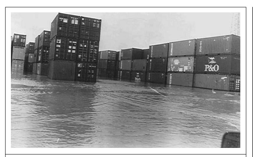
PHOTO 3 Cargo containers at the Port of Mombasa partly submerged in water during flooding

loss of cultural heritage, especially historical and archaeological sites and monuments. It could also cause the spread of climate-sensitive diseases such as cholera, which may affect large numbers of people due to high population densities in cities, and could lead to high loss of life as health institutions and residents are often caught unawares. These impacts also disrupt normal livelihood activities and school attendance.