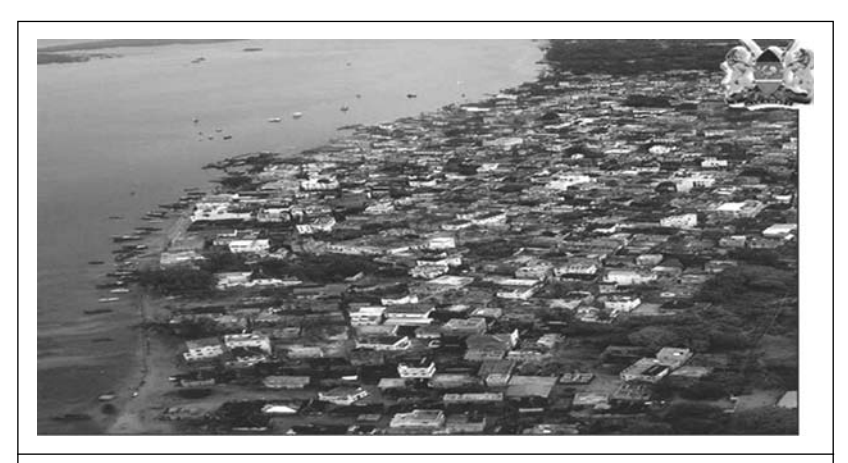
PHOTO 2 Settlements close to the ocean shore in Mombasa Old Town