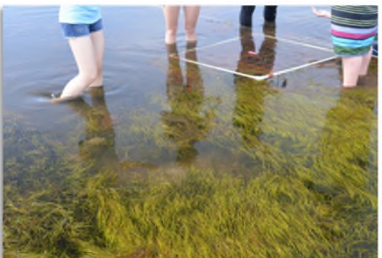
Students conducting transect and quadrat sampling of shoal grass.

The biological monitoring objectives were to document the biological characteristics of the IRL and coastal ocean near the proposed inflow locations and assess the likely biological response to an inflow system. This approach assessed seagrass and drift algae near the proposed inflow sites and evaluated the percent cover, density, and canopy height. Sediment samples collected on the lagoon and ocean sides of the proposed inflow sites evaluated the abundance, diversity, and richness of fauna as well as environmental parameters in the