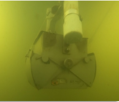
Ekman Grab Sampler (above) and ADCP (below) deployed in the IRL

The geochemical baseline objective was to identify a suite of geochemical parameters to make a comparison between the baseline and enhanced inflow conditions. These parameters are important indicators used to calibrate the models and provide predictors and causation for ecological shifts from the geochemical cycling of nutrients and other parameters. This approach deployed an array of sensors to continuously monitor bottom water conditions, including temperature, dissolved oxygen, and salinity (selected sites), near possible inflow locations. In addition, discrete nutrient samples were collected to vertically profile the areas adjacent to the potential inflow locations. Sediment samples were collected to evaluate variables that correlated with geochemical nutrient cycling. Benthic chambers equipped with sensors were deployed to evaluate geochemical changes in the sediments. These approaches were implemented at each inflow location on the ocean and lagoon side.