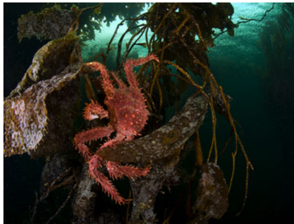
Fig. 1 A kelp forest in the Cape Horn Biosphere Reserve, Chile. This habitat is extremely important as a CO 2 sink and for fisheries. Centolla crab Lithodes santolla growing on Macrocystis pyrifera at the Capitan Aracena Island, Magallanes.

Multiple human impacts endanger Latin America coastal habitats. Changes in the composition and distribution of sensitive habitats are already occurring (Martins et al. , 2012), with highly impacted sites in the Eastern Caribbean, and medium to highly impacted zones around almost the entire continent (Halpern et al. , 2008). Without timely action the situation will steadily deteriorate. Bleaching and diseases in coral reefs (Fig. 2), both linked to ocean warming, are becoming an increasing problem (Wilkinson & Souther, 2008). Kelp forests have proven to be highly susceptible to temperature and current changes (Wernberg et al. , 2011) and ocean acidification not only threatens to degrade the world's largest rhodolith beds along the Brazilian coast (Amado-Filho et al. , 2012) but also to seriously reduce the ability of edible shellfish, such as mussels and oysters, to produce shells, thereby threatening local aquaculture activities and food security. Extreme events, such as cyclones, are occurring with greater frequency (Emanuel, 2005), thereby impacting coastal habitats, with particular severity in the SE Atlantic coast. Moreover, harmful algal blooms, partially related to temperature increase, have negative impacts on the quality of coastal areas as a whole.