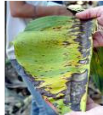
Effects of black sigatoka disease on banana crops

Environmental globalisation takes the form of global climate change caused predominantly by the growing greenhouse gas emissions of the global energy sector, particularly by the countries of the Organisation for Economic Co-operation and Development (OECD); a situation beyond the region's control and which leaves it extremely vulnerable. According to the Inter-Governmental Panel on Climate Change (IPCC), the countries of the Caribbean are among the most susceptible to the likely impacts of climate change. 26