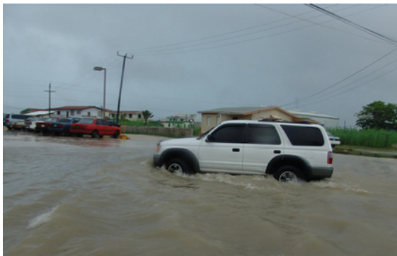
Belize City flooding, June 2008.

This regional framework document provides the opportunity to systematically address the development challenges posed by climate change for the Caribbean.