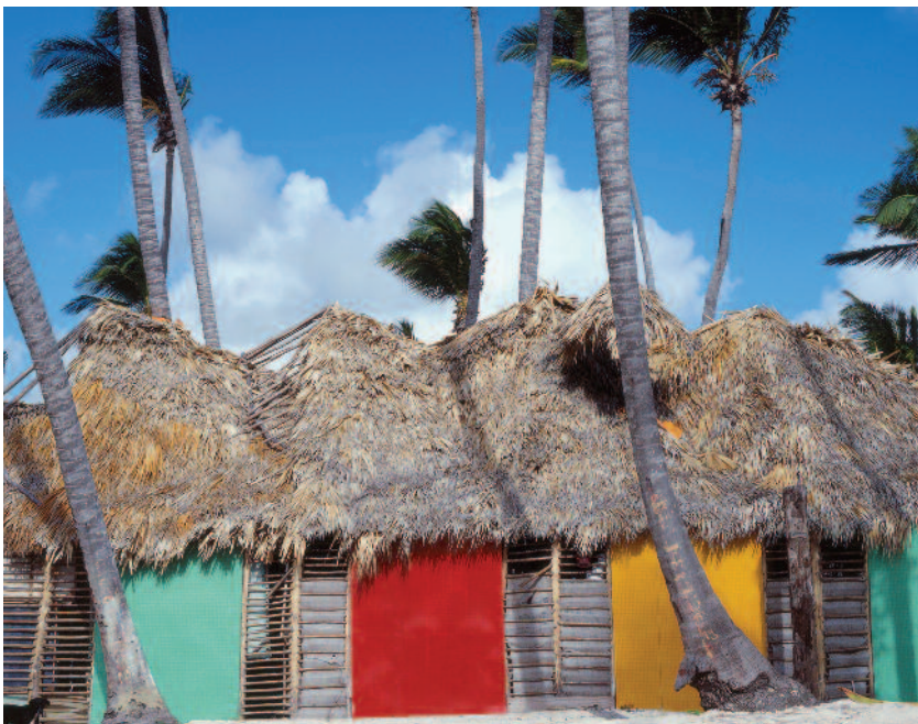
Table ES-2 presents the cost of inaction for each country included in the study. While the regional average is large, rising from five percent of GDP in 2025 to 22 percent in 2100, there is also considerable variation around this average; some countries have much higher projected impacts. The projected cost of inaction reaches an appalling 75 percent of GDP or more by 2100 in Dominica, Grenada, Haiti, St. Kitts & Nevis, and Turks & Caicos, and smaller, but still impressively high levels for a number of others islands.

Sources: Authors' calculations. Amounts in 2007 dollars; percentages based on 2004 GDP.