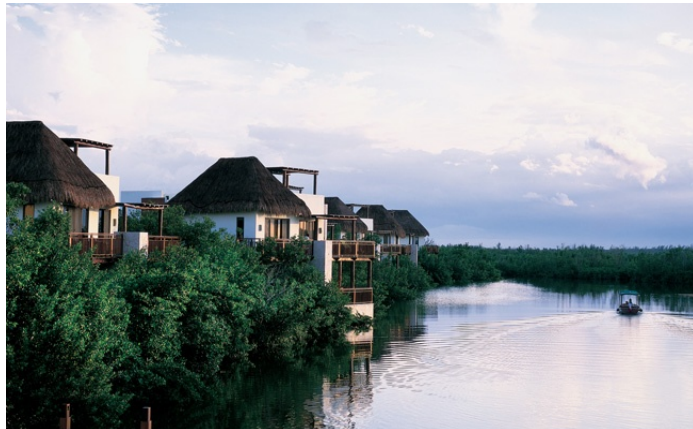
Artificial canals at Fairmont Mayakoba

http://www.rosewoodhotels.com/en/mayakoba/press/press_room/index.cfm/rosewood-mayakoba-recognized-for-sustainable-tourism .