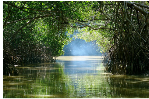
Mangrove along Mexico's coast

A more accurate EIA can help strengthen the cost-benefit analysis too, by zeroing in on the true costs of large scale development. Currently, the cost-benefit analysis does not consider environmental impacts because it is typically conducted before the EIA. Since environmental impacts are a real part of the cost of tourism projects, they should be calculated ahead of time and incorporated into the cost-benefit analysis to determine viability. When selecting a site for large scale coastal tourism development, it is important to consider that converting land in this way precludes other uses in the future that have their own value. FONATUR states that its tourism developments are built to last "100 years or, if properly maintained, indefinitely." 76 That means the land will not be suitable for alternate economic activities for a very long time. Once a site is developed for large scale tourism, it becomes inappropriate for lower-impact nature-based tourism or alternate industries. A forward-looking "highest and best use" analysis is warranted at the outset.