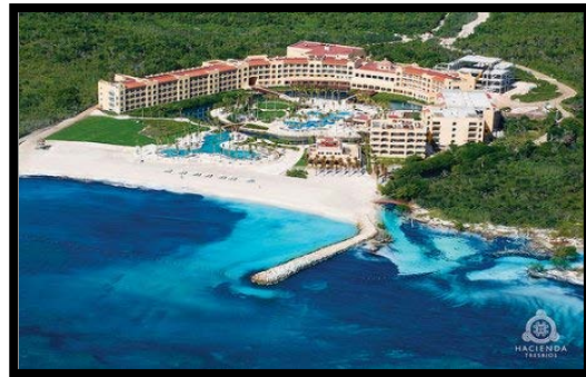
Hacienda Tres Rios