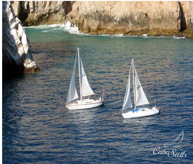
Sailing near Los Cabos

Despite this innovation, a coalition of international organizations, environmental lawyers, and grassroots groups, tried to stop construction of the Puerto Los Cabos Marina, arguing it would cause environment damage to the estuary, consume large quantities of scarce fresh water, create huge waste issues, and dislocate a number of local communities. Opponents of the project state that many of the town's former residents sold out and have moved away. In 2006,