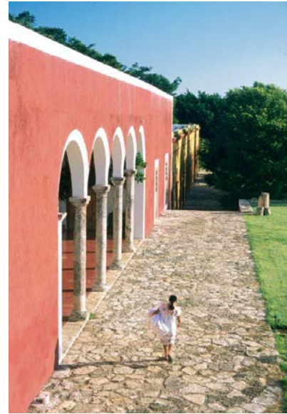
Las Haciendas

In 2002, following Hurricane Isidoro which caused great devastation in the Yucatan, Grupo Plan’s social commitment to Mayan communities increased exponentially. To develop self sustainable development projects, Grupo Plan created the Fundación Haciendas del Mundo Maya, 172 a nonprofit organization whose mission is to “create actions which foster the identity, recognition and rescuing of the expressions within the Mayan cultural universe, overcoming extreme poverty by furthering education, health, and sustainable development opportunities while involving the local population as promoters of their own social projects” 173 The Foundation has contributed to the preservation of traditional medicine and cultural cuisine and the creation of jobs using Mayan handicraft skills that were being lost with the passing of each generation.