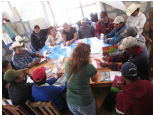
Indigenous Tourism Workshop

Tourism projects and their visitors inevitably impact the surrounding community. It is the responsibility of FONATUR and private developers to consult with the community to mitigate negative impacts and to maximize the development's benefits to and acceptance by the surrounding community. If community members are not involved early on, important considerations may be overlooked and these could be costly to address at a later stage. Establishing a