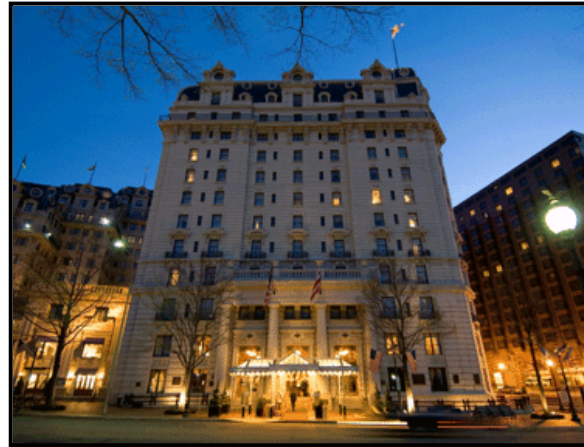
Willard InterContinental Hotel, Washington DC, Credit: washington.intercontinental.com

A no-cost initiative of the hotel has been its travelers' philanthropy program, in which guests are encouraged to contribute between one and five dollars per day to community projects upon checking in. Approximately 70% of guests opt into the program. The hotel has also taken the extraordinary step to calculate the total amount in cost savings from the towel and linen re-use program, and to donate an equivalent amount to watershed protection of a nearby, polluted river.