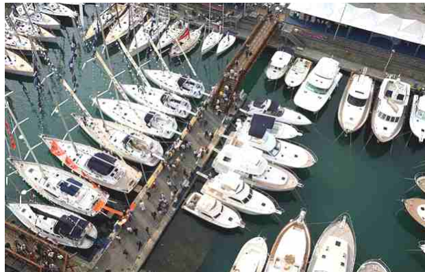
Marina with variety of boats

Marinas may include a range of types of boating infrastructure for leisure and tourism, all under one management. A central component is wet slips, which are berthing spaces designed for mooring individual watercrafts. Berthing is usually provided by a fixed or floating dock connected to land, in a water body of sufficient depth and adequate protection. Marinas can also provide a “dry storage” in a land based facility for storing watercraft or a “drystack”, an onshore storage that holds boats vertically in racks.