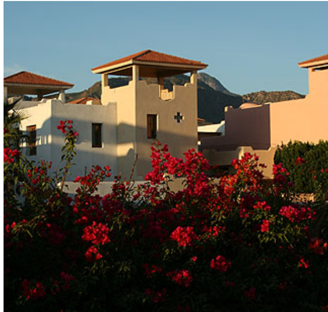
Courtyard Homes, Villages of Loreto Bay

There are a handful of luxury residential tourism projects in Mexico that incorporate components of environmental and social sustainability. One is the Mayakoba vacation homes that are part of the Mayakoba resort complex 223 in the Riviera Maya; another is the Pedregal Cabo San Lucas, which is billed as “the first luxury Green Home in Los Cabos” using LEED guidelines and as contributing a portion of its “proceeds will go towards GREEN FOUNDATIONS and spine injury foundations.” 224 A new project still in the design and early development stage, is Amaitlan, located on a 2400 ha. peninsula in Mazatlan in