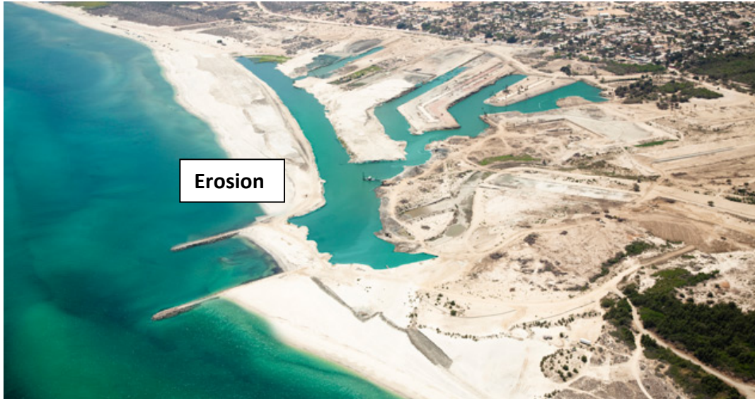
Cabo Riviera Marina and Resort, Phase 1: April 2011 245

Just south of here, an even more massive project, Cabo Cortes, includes plans for a major marina for 490 wet slips, three golf courses, and 27,000 hotel rooms -- almost as many as Cancún has today and almost three times as many as currently in Los Cabos. Cabo Cortes is, however, being opposed by a coalition of environmental organizations and local residents who charge it will consume 100% of the fresh water in the area's one healthy aquifer, destroy virgin sand dunes, and damage the Cabo Pulmo National Marine Park, which is described as "the world's healthiest marine reserve." In early 2011, SEMARNAT quietly gave the Spanish development conglomerate, Hansa Urbana, the green light to begin construction; however, in late 2011 it ruled that construction can only begin if the developers can prove by January 2013 that the reef will remain unharmed. In the wake of the European debt crisis, the financially ailing Hansa Urbana turned over ownership of the project to a Spanish bank, leaving in doubt who actually controls the mega-marina-resort project. 246