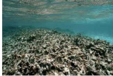
Coral Bleaching

Rising temperatures are the greatest threat to coral reefs, causing coral bleaching, ocean acidification, and, there is strong evidence, increases in infectious diseases in corals. 94 Coral bleaching stress occurs when water temperatures exceed 1.0 °C above the maximum mean summertime temperature, 95 and this is already occurring along the MesoAmerican Barrier Reef and along Mexico's Pacific coast and sea of Cortes, with impacts likely to increase over time. 96