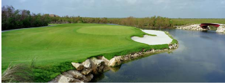
El Camaleón golf course

From the start of construction in 2004, El Camaleón worked to meet Audubon International criteria. According to Erin Stevens, Superintendent of the golf course, “We built our entire maintenance facility to environmental specifications, designed a contained drainage and reclamation system for the golf course, conserved water, reduced fertilizer and chemical applications, and created a multitude of environmental buffers and corridors for native wildlife.” Stevens says that “from the start of this project to the present” it has been “amazing to see the vast increase in wildlife, migratory birds and even the Wood Stork, which is on the endangered species list.” 311