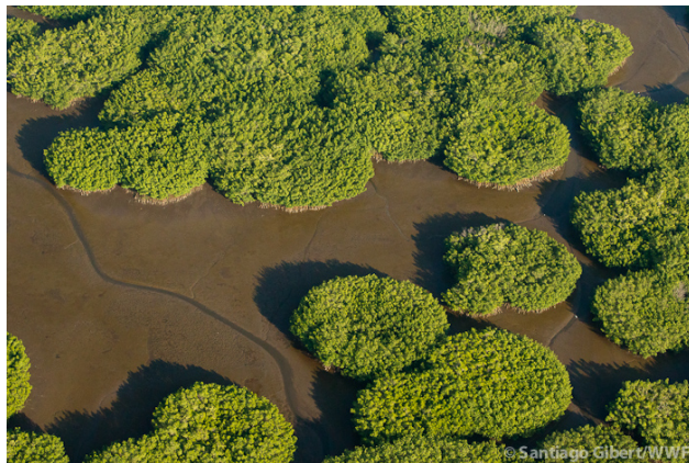
Marismas Nacionales