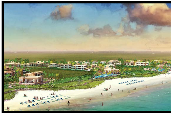
St. Regis Kanai

The third, the Kanai Resort (264 ha), which is to be developed by Mexican real estate developers ALHEL and GIM, had not yet broken ground as of June 2011. However, Kanai has already signed on the hotel brands St. Regis (Starwood) and Park Hyatt (Hyatt Hotels) to manage the hotels once they are built. The hotel plans to open in 2014. 160 Its master plan envisages 847 rooms as well as a system of water canals.