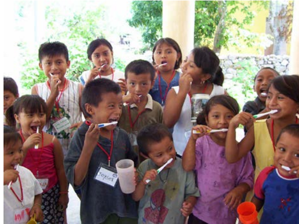
Foundation Haciendas del Mundo Maya supports public health education, Credit: Fundación Haciendas del Mundo Maya

2. Promotion and Strengthening of Educational Services: Between 2003 and 2011, the Foundation helped to build six community libraries and five educational spaces, bringing educational activities to 11 communities, a total of 56,080 people. Programs offered have included continuing education, computer services, internet access, reading rooms, Mayan cultural heritage, and artistic activities. Adult literacy programs were developed in six communities and cater to the needs of over 500 people, while parenting schools are run in ten communities, resulting in improved family cohesion. For those communities without a library, the Foundation provides a mobile library that serves the needs of nearly 4,000 children, lending 19,667 books between 2008 and 2011.