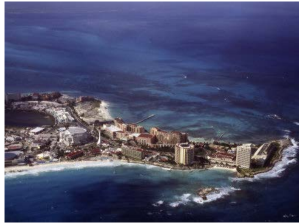
Aerial View of Cancun

Unfortunately, FONATUR (with SEMARNAT's approval) has often chosen coastal locations where large scale tourism development has caused environmental and social damage. The first five CIPs (Cancún, Los Cabos, Ixtapa, Loreto, Huatulco) were selected before many of the internationally recognized good practices for sustainability had emerged. The sites were viewed as blank slates with natural beauty and without significant existing populations, so scant care was taken to protect fragile ecosystems. Cancún is located on naturally wide beautiful white sandy beaches, turquoise waters, an abundance of coral, and a lagoon that is home to a wide variety of indigenous species. "The resulting tourist industry," states a study on coastal development, "extensively damaged the lagoon, obliterated sand dunes, led to the [local] extinction of varying species of animals and fish, and destroyed the rainforest that surrounds Cancún." 53 Another study found that the scale of development also damaged Cancun's underground water systems. 54 FONATUR's mega-resort development in Huatulco "accelerated the process of social and spatial polarization, impoverishing the native populations and raising tensions throughout the region." 55