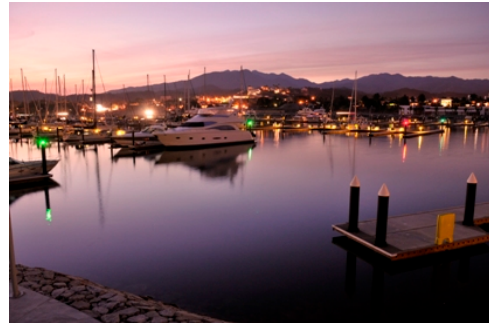
Paradise Village Marina and Yacht Club

where they must fulfill 100% of those best practices that are required by U.S. federal, state, city or port regulations, as well as a minimum of 75% 271 of other non-legally binding good practices.