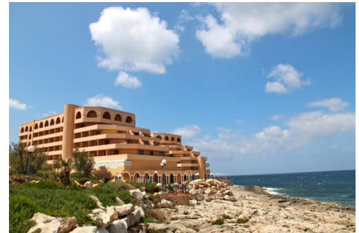
Radisson Blu Resort & Spa, Malta Golden Sands

In 2003, the owner of the Golden Sands located on the island of Malta off Italy took the unprecedented decision to completely rebuild the resort to conform to internationally recognized good practices in sustainable siting, design, and construction. The owner, Island Hotels Group, worked closely with the Malta Environment and Planning Authority to ensure that the property and landscaping would be more sensitive to its surroundings and that environmental considerations were fully integrated into the resort.