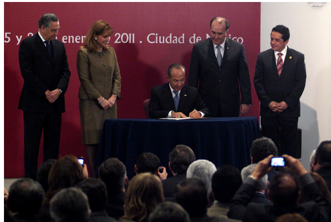
President Felipe Calderon signing the National Accord for Tourism

Since 1995, Mexico's global ranking for tourism arrivals has gradually fallen, even though overall, the number of international visitors has grown modestly, from about 20 million in 1995 to just over 22 million in 2010. But as global travel has rapidly expanded, Mexico's ranking among other countries has steadily slipped, from 7 th in the world in 1995 and 1996, to 8 th in 1998 – 2000, to 10 th in 2010. 5 Mexico's global ranking for international tourism receipts has also fallen, despite an upward trend in international receipts per tourist arrival. In 1990, Mexico was ranked as 10 th in international tourism receipts; however, in 2010, Mexico had dropped significantly to 23 rd place, behind, for instance, Turkey, Canada, Hong Kong, and Greece. 6