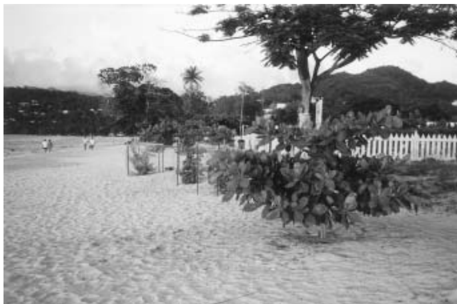
Photo 6. Replanting efforts at Grand Anse, Grenada. September 2001.

Responding to this concern, a visit was made to Grenada two weeks after Hurricane Lenny to assess the damage and make recommendations for rehabilitation. (This visit was funded by the CDB-UNESCO project and the Organization of American States.) Following several meetings, a report was produced (Cambers 1999a) advising the Grenadian authorities not to rush to construct remedial structures, but rather to wait for natural beach recovery. After the visit, a committee was organized comprising the Board of Tourism, the Forestry Department, the NSTC, the Organization of American States, several hoteliers and others, to implement the recommendations of the report which included a beach planting programme and the removal of certain damaged structures. As predicted, the beach recovered following the hurricane; this can be seen visually and in the monitoring data, although more time will be required to determine whether the beach fully recovers to its pre-hurricane size.