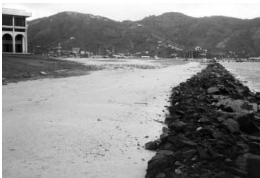
Photo 4. Rock revetment protecting the Government Administration Building, Road Town, Tortola, British Virgin Islands May 1998.

tion and assessment of new structural developments, changing beach uses, restriction of beach access, nature of beach dynamics etc. So officers involved in monitoring become knowledgeable about all aspects of their island's beaches and can