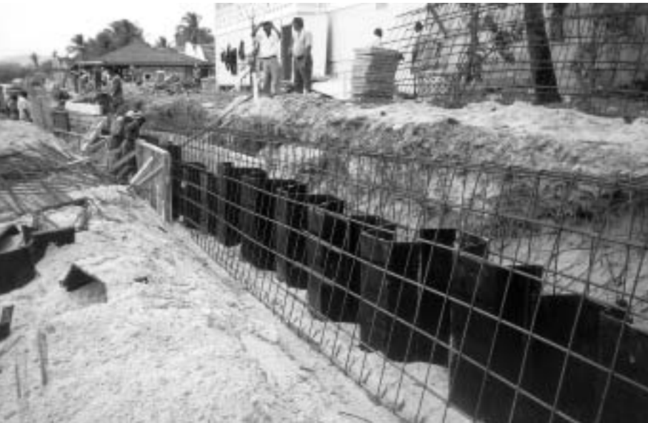
Photo 10. Seawall under construction, Reduit Beach, St Lucia. April 2000.