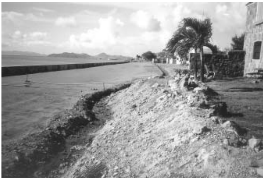
Photo 8. Reclaimed land at Charlestown, Nevis. September 2000.

base have also been installed at the Department of Planning and Development and two persons there trained in its use.