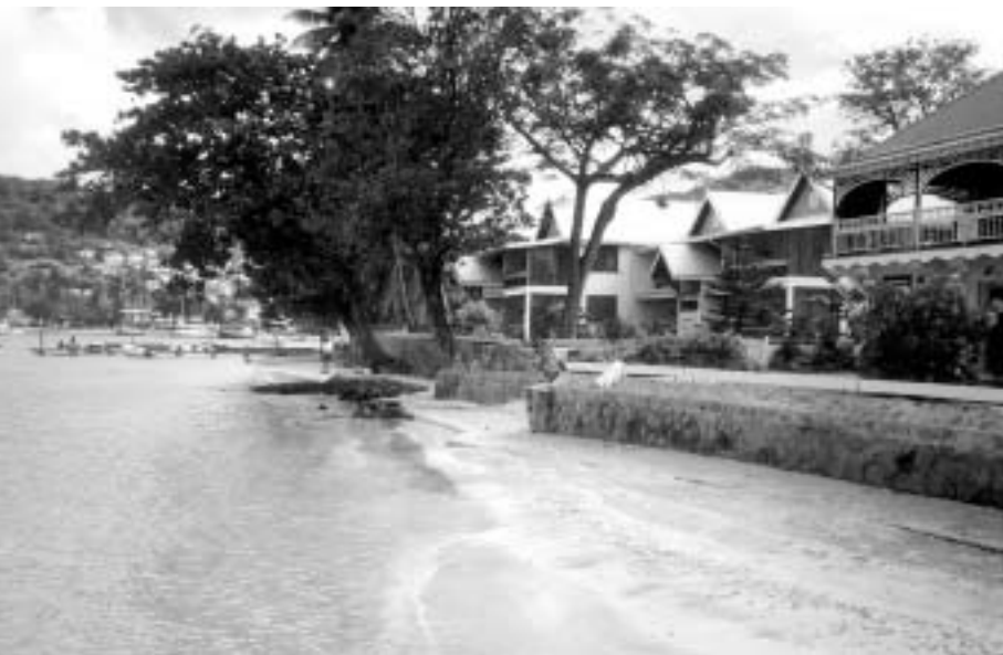
Photo 11. Retaining wall, Port Elizabeth, Bequia, St Vincent and the Grenadines. November 2000.

Another coastal problem in St Lucia relates to beach sand mining, which again has become a serious issue. Sand mining is under the jurisdiction of the Ministry of Communications and Works. Considerable efforts were made in the early 1990s to ensure that this Ministry was fully aware of the adverse impacts of beach sand mining. However, with a very high staff turnover at this Ministry, such efforts have to be continued, so that the impacts of activities such as sand extraction at river mouths are fully understood and remedied.