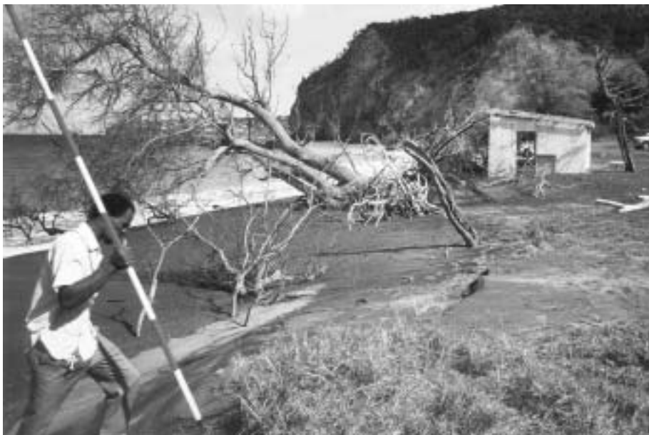
Photo 7. Foxes Bay, Montserrat, one month after Hurricane Lenny, December 1999.

The beach-monitoring database was used by the Physical Planning Unit during the period 1992–1995, when a programme was established to stop the mining of beach sand at all beaches except Farms Bay, and to use quarry sand for all construction purposes except the final plastering/finishing of buildings. 6 However, due to the