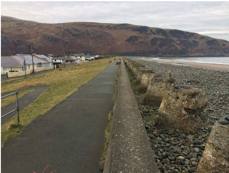
Figure 3. Sea defences at Fairbourne. Policies based on the SMP2 propose to maintain this infrastructure for about 40 years after which point the coast will be realigned.

However, a 2014 BBC news report which highlighted the possible loss of coastal communities in Wales generated significant local and national attention. In interviews with the Gwynedd Council project manager for Fairbourne, this report was cited as the impetus for local conflict. 5 Statements by the BBC (2014a, 2014b) suggested that