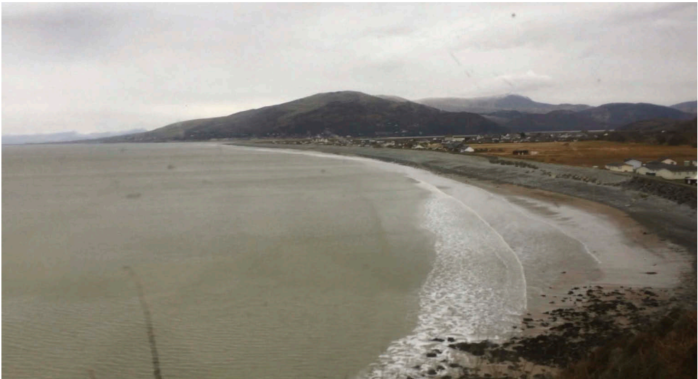
Figure 2. View of Fairbourne looking north.