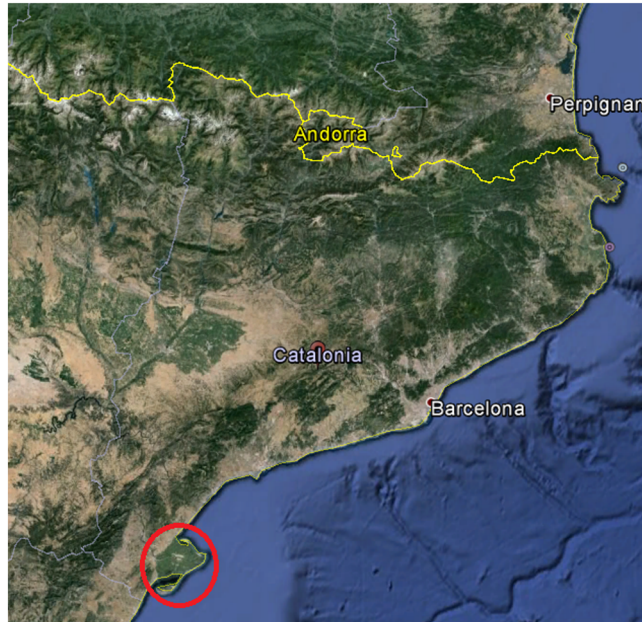
Figure 3. Spain – Catalonia – Ebro Delta