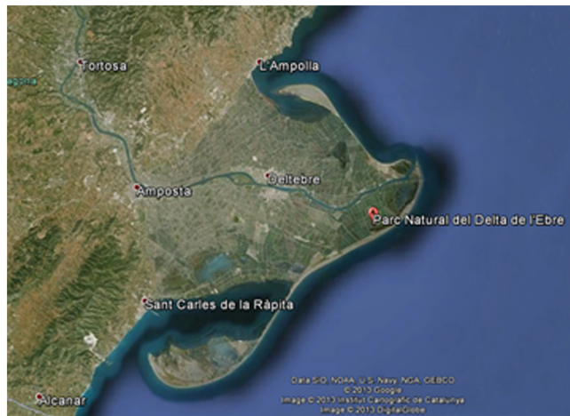
Figure 4. Ebro Delta

Past state initiatives for water transfers from Ebro to other parts of Spain have been a controversial issue, which has resulted in the creation of the local activist group Plataforma en Defensa de l'Ebre (PDE 5 ), which opposes transfers. Mini-transfers to the city of Tarragona were approved by law back in 1981, and the National Hydrological Plan (PHN 6 ) of 1989–1993 approved the emergency transfer of water to Mallorca from the port of Tarragona in 1994. The second PHN, which planned the transfer of 1050 cubic hectometres to Barcelona, Valencia, Murcia and Almeria, was repealed by the National Government – Congress (Royal Decree-Law 2/2004 of 18 June, and Law 11/2005) after several spectacular public protests back in 2001. Action from social movements together with academics and