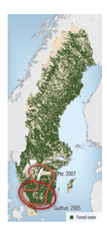
Box 1: Major storms and related forest damage

Gudrun , January 2005 Damaged forest: 75 million m<sup>3</sup>