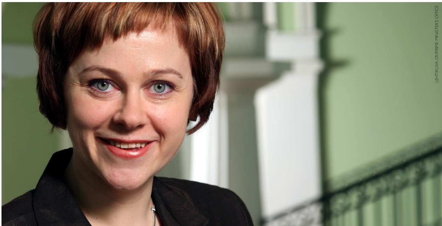
Paula Lehtomäki, Vice-Chairperson, Minister of the Environment