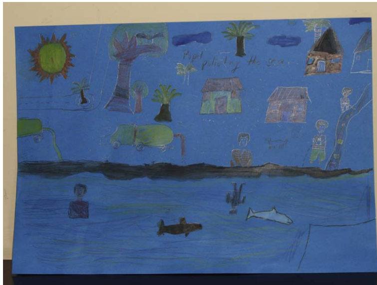
Figure 1. A painting showing a range of different activities in the coastal zone. The painting includes: lorries discharging effluents; humans defaecating and urinating; living palms on land and fish in the sea; and a person bathing/washing in the sea Note: that the sand is coloured black.