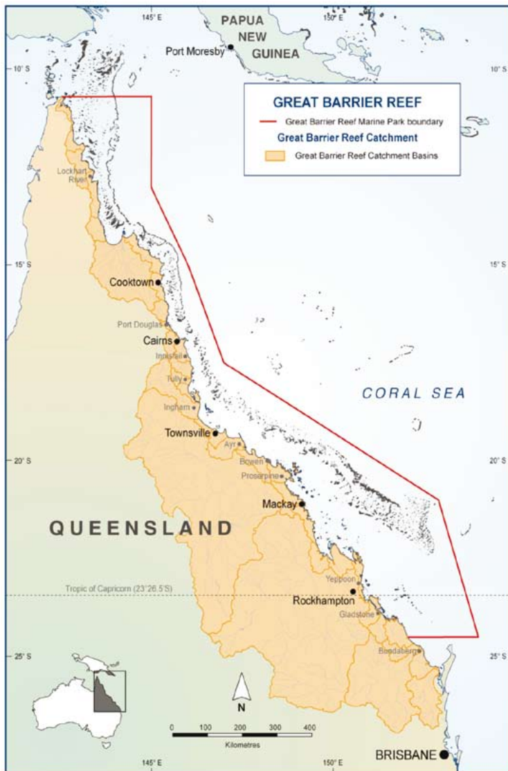
Figure 23.1 Great Barrier Reef catchment areas and urban centres

Management and protection of natural resources in the adjacent GBR catchment is the primary responsibility of the Queensland Government and seven regional Natural Resource Management (NRM) organisations, from Torres Strait in the north to Burnett Mary in the south (Figure 23.2). Within the last two to three years each NRM organisation has developed a natural resource management plan and investment strategy for the management of natural resources in their region, which includes estuarine, coastal and marine habitats. In the 2003–2004 financial year, A$12.2 million was spent by regional NRM organisations on the management of natural resources from Natural Heritage Trust funds alone.