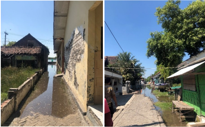
Fig. 4. Some areas in Kepetingan Hamlet are inundated during daily high tides

productivity. In the old times, the elevation of the land was 2 meters, which was used to prevent land from high-tide flooding.