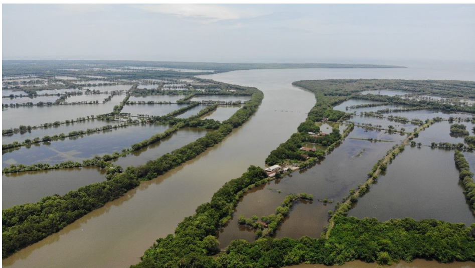
Fig. 1. Aerial photography of Kepetingan River estuary. Most of mangrove areas were converted to the traditional shrimp farms

Aim of this research is to analyse the condition in a remote Kepetingan Hamlet in facing climate change challenges, as well as to determine the suitable solutions regarding those condition from socio-economic resilience approaches. Primary environmental data were collected from Kepetingan Hamlet, Kepetingan River and Permisan Bay. Descriptive analysis is presented as preliminary look at the coastal climate adaptation and resilience in Kepetingan.