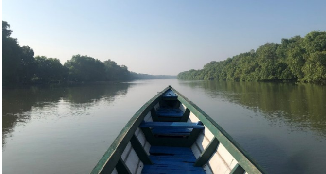
Fig. 6. Boating on Kepetingan estuary as one of the ecotourism product