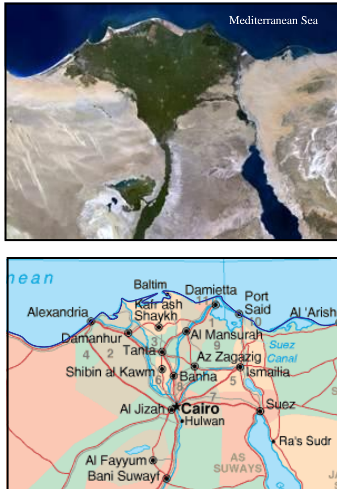
Figure 1: Top: Satellite image of the Nile delta Bottom: Map of the Nile delta and main cities;