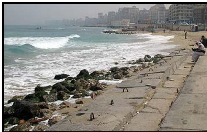
Figure 4: weakness of the erected sea wall on Alexandria shore.

A one-meter SLR in the Mediterranean will possibly submerge Alexandria. Weakness of the erected sea wall on Alexandria shore is shown in fig. 4. This highlights the deadly exposure of its inhabitants, since storm water drainage infrastructure is often outdated and inadequate in low-income urban centers. Generally, fundamental and low-lying installations in Alexandria and Port Said are endangered by SLR and the recreational tourism beach facilities are at risk.