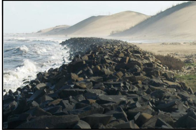
Figure 5: Shoreline at the middle delta coast: protection works and sand dunes.