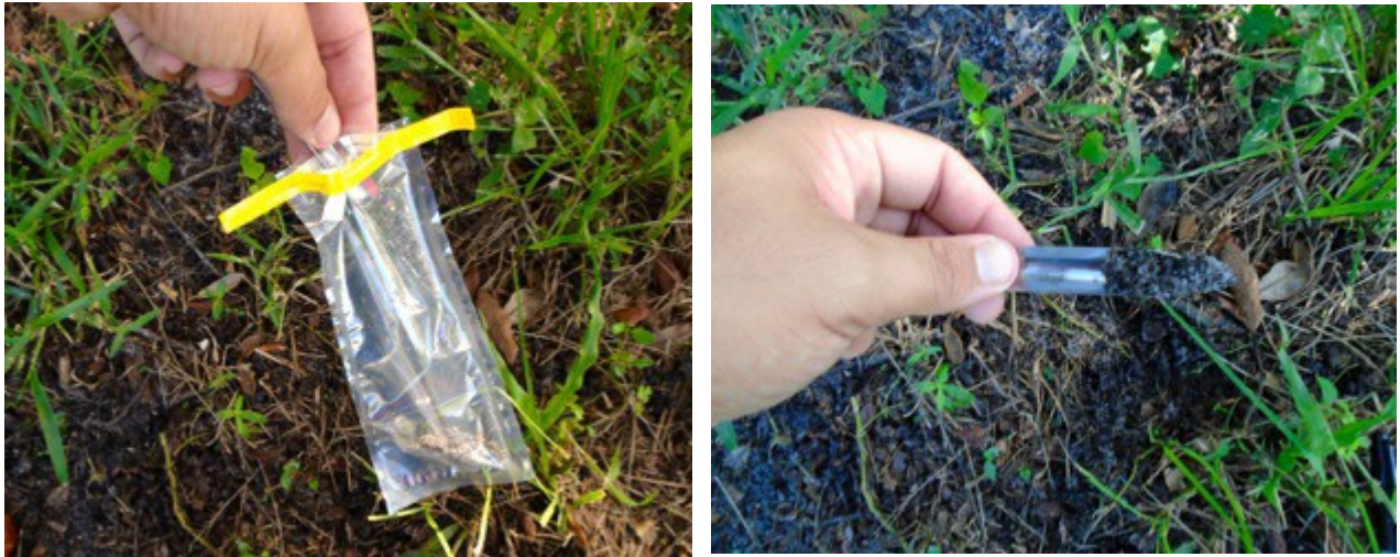
Figure 2: Scoopula in use