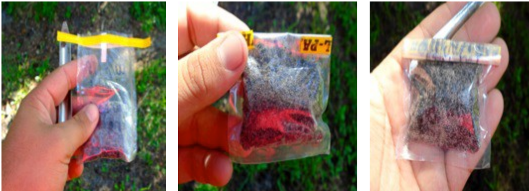
Figure 5: Sealing the Whirl-pack bag