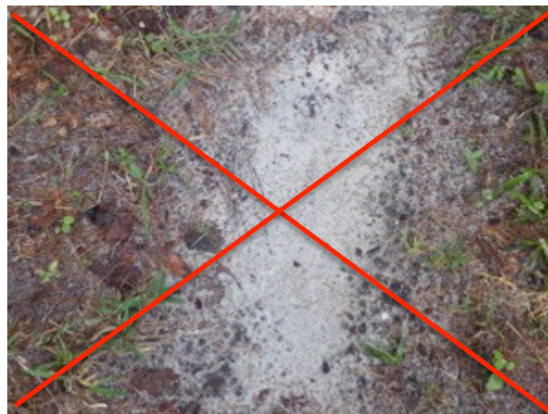
Figure 3: Shows examples of ideal collection sites and a sandy soil site that should not be used