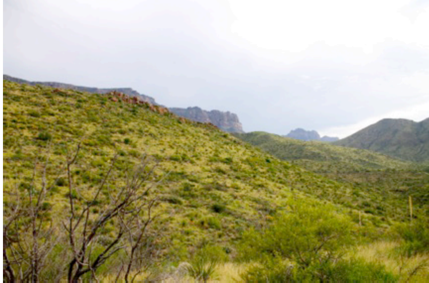
Figure 6: Examples of changes in habitat