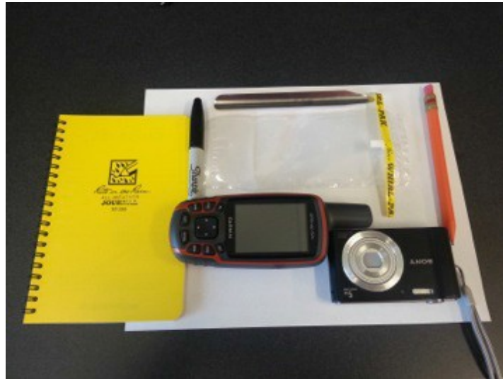
Figure 1: Sampling equipment

Note 1: Be sure to pack plenty of water, food and sun protection for the trip.